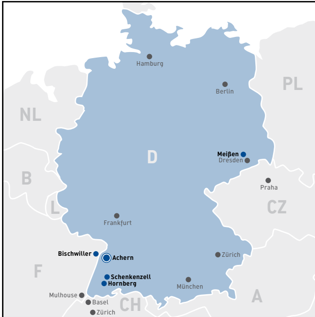
The Achern site is located in southern Germany, close to the Rhine River and France.